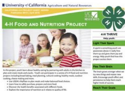
4-H Food and Nutrition