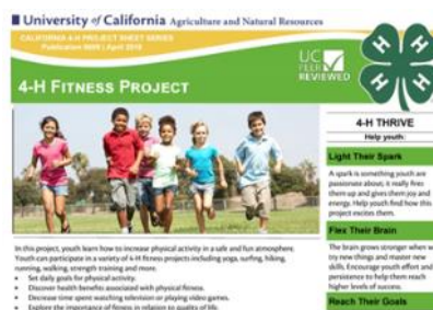
4-H Fitness Project