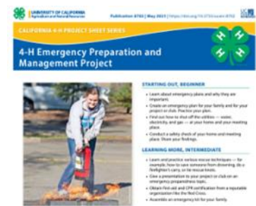
4-H Emergency Preparation