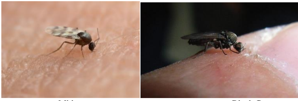
Midge Black fly