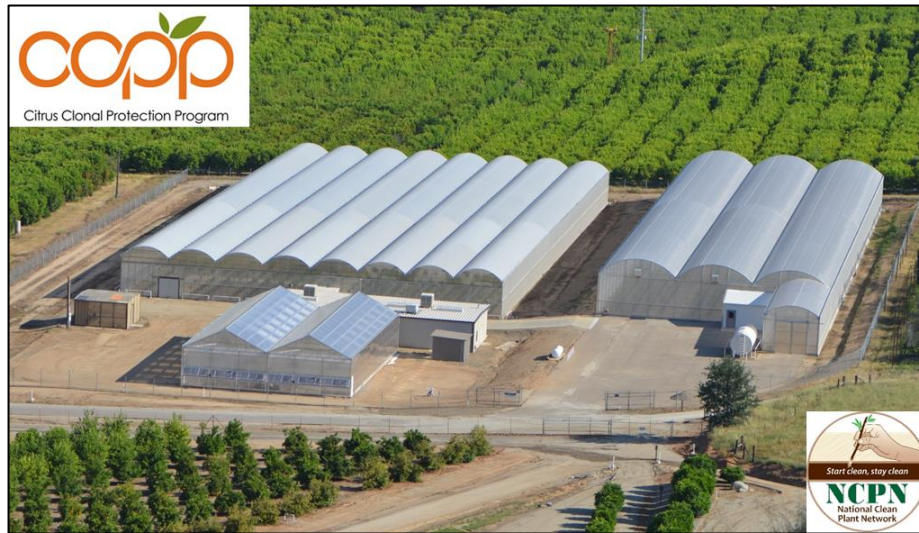
Figure 1 Panoramic view of the Citrus Clonal Protection Program foundation block operations at the Lindcove Research and Extension Center, Exeter, California.

To learn more about the CCPP, go to www.ccpp.ucr.edu and remember: CCPP is the place for starting citrus correctly.