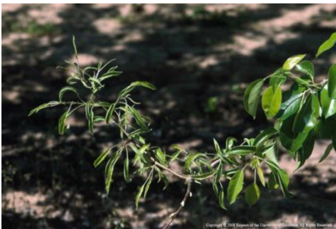
Glyphosate Damage