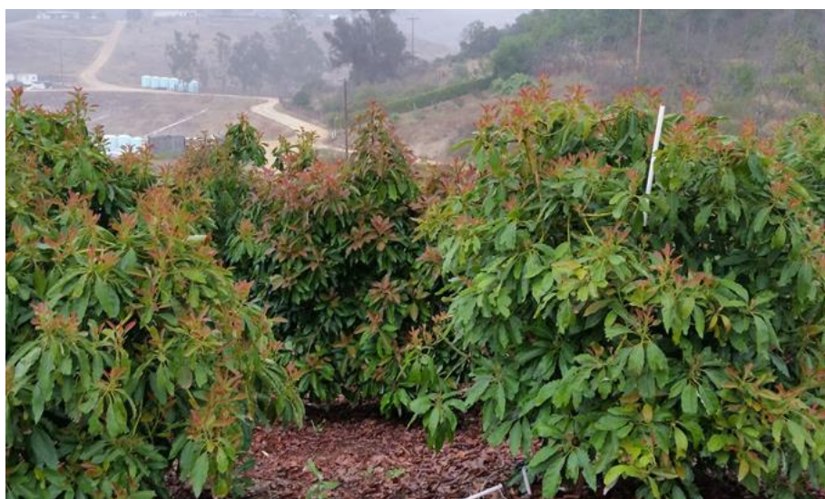
Figure 1. (10' x10' spacing) of 72 trees of Hass and Lamb Hass avocados were planted in Valley Center, CA in August 2012. Also a pollinizer Zutano tree was planted for every 8 Hass trees.

We estimated the costs of water and pruning for the experiment and compared them with the costs of the conventional practices we developed in 2011 (adjusted for inflation). We compared the costs on a cost of a unit of production, i.e. cost per lb. of yield (Table 1).