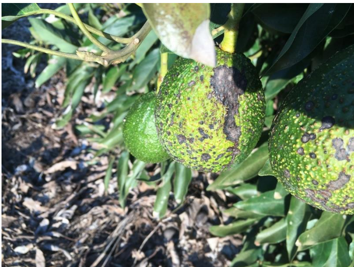
Paraquat Fruit Damage. B. Faber