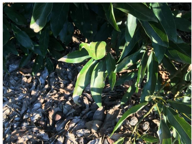
Paraquat Leaf Damage. B.Faber