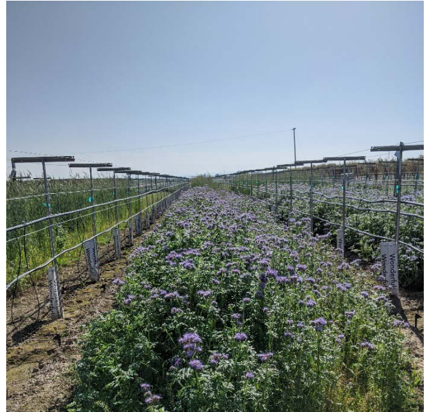
Cover crop trial in Parlier.