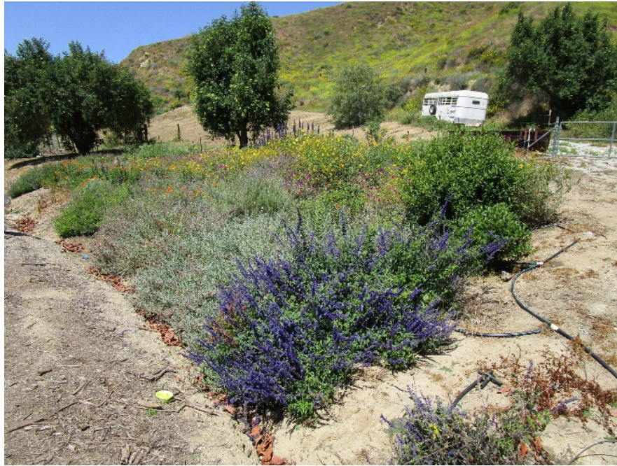
An example of a Habitat Garden

https://ucanr.edu/blogs/blogcore/postdetail.cfm?postnum=41435&sharing=yes